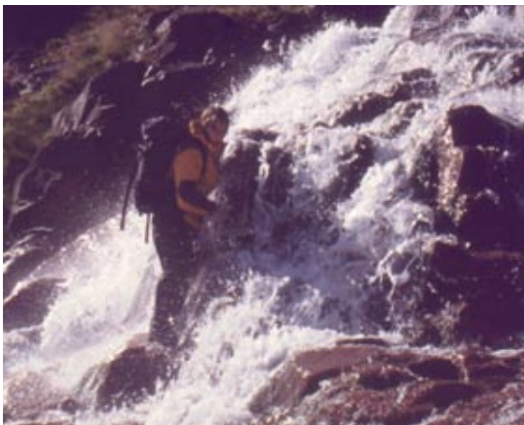
Scrambling not alongside but inside the Garbh Uisge

According to a recent guidebook by Paul Dearden called 'Classic Rock', "it is now possible to become a 'good climber' without ever going to the mountains, or even to the gritstone edges of Derbyshire". His book of classics contains nothing under E3 (seven grades harder than Pygmy Ridge), nothing from longer ago than 1980, and nothing in Scotland. And when you've looked at the book's pictures of Ride the Wild Surf (one pitch, 150ft, E4 6a in Dinorwig slate quarries, bolted and with some artificial holds) you realise why climbers can't be bothered with the five-hour walk to Carn Etchachan above the Shelter Stone.