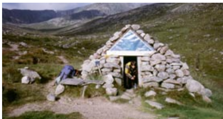
Garbh Choire shelter: few comforts, but lots of Location, Location, Location