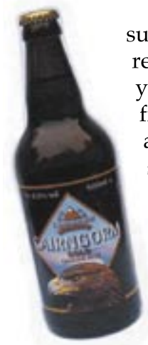
Fluid intake is crucial though a Cairngorm beer should be reserved for a post-scramble treat

Thus it was that I found myself climbing Cairngorm by a surprising route. The first surprise was Coire an t-Sneachda. Cairngorm's northern corries expose themselves recklessly to travellers on the road alongside Loch Morlich. They're not afraid to show you everything they've got, even though all they've got is a gentle hollow and a slim fringe of scrappy crag around the rim. Except that when you get there, Sneachda has a splendidly unfriendly floor of bare boulders, and small grey pools of water, and a stretcher box to remind us of our mortality. Sunlit forests are a flat and far-below world glimpsed over the rim. On the other three sides, the boulders slope up to the bottoms of rockfaces that, now we're up and under them, suddenly look serious. It's still not quite a proper Scottish corrie,